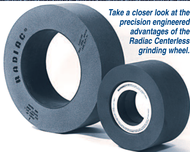
Take a closer look at the precision engineered advantages of the Radiac Centerless grinding wheel.

Including Regulating Wheels and Dressing Tools