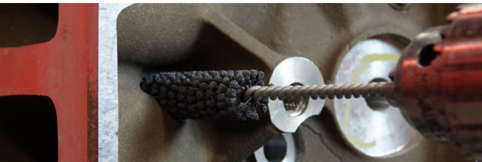
Cleaning burrs out of an automotive head port.