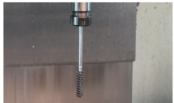
Collet ready CrossFlex brush in a CNC machine.