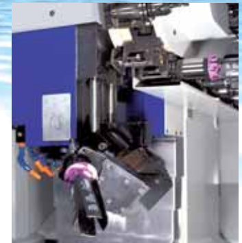
Clean-Tec may be utilized in all horizontal and vertical machining centers by using a normal chuck with clamping diameter 20 mm or 3/4".