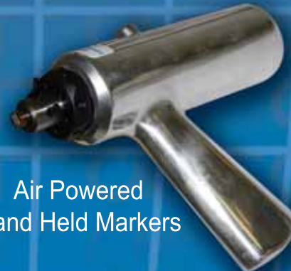
Air Powered Hand Held Markers