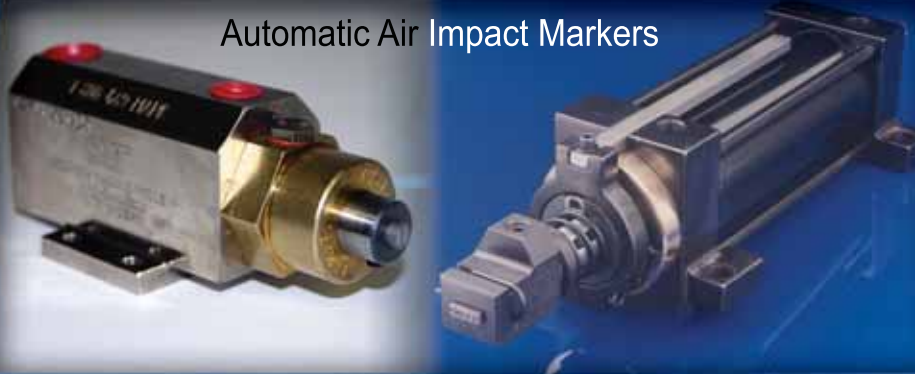
Automatic Air Impact Markers