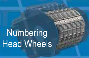
Numbering Head Wheels