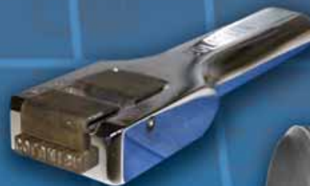
Quick Change Hand Holders