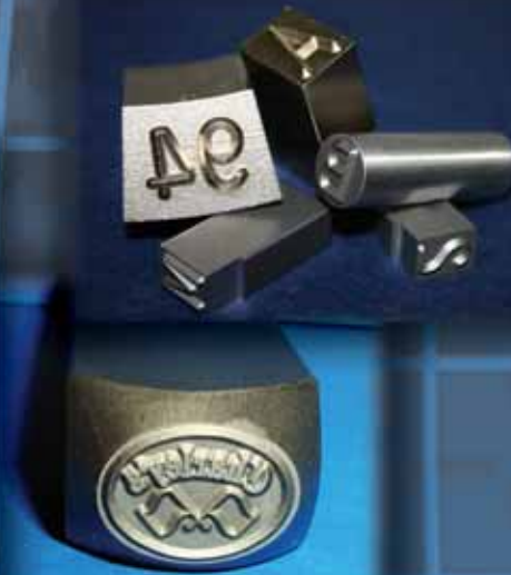
All Shapes and Sizes