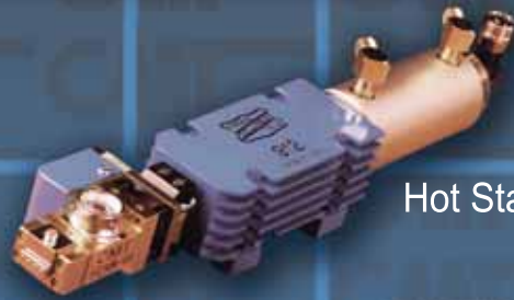
Hot Stamp Marker