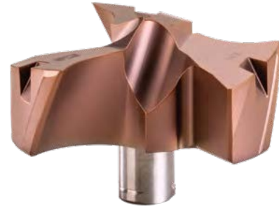
Universal Flat Shank (FD) • 3xD, 5xD, 8xD