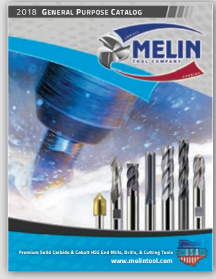
GENERAL PURPOSE CATALOG