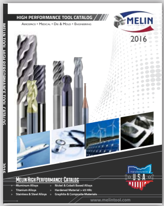
HIGH PERFORMANCE CATALOG