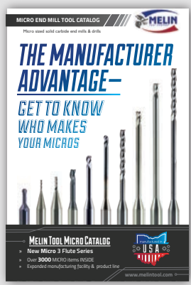
MICRO TOOL CATALOG