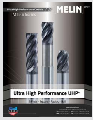
ULTRA HIGH PERFORMANCE FLYER

Call Customer Service to order one of our catalogs or download our interactive PDFs online at www.melintool.com PH: 216-362-4200 or 1-800-521-1078