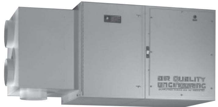
F66 shown with optional source capture plenum.