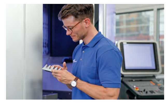
Stable emulsion and clean workpieces