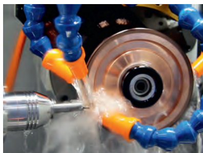
Anca EDG: PCD rotary eroding and carbide tool grinding in one