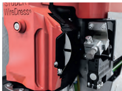
Grinding machines equipped with Studer WireDress