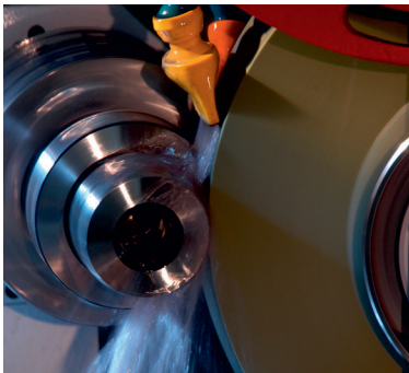
Cylindrical grinding (picture shows Studer machine)