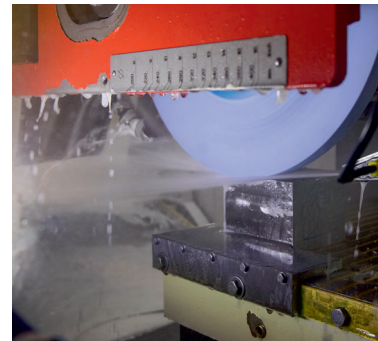
Surface grinding (picture shows Blohm machine)