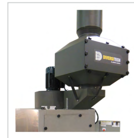
High-efficiency Hepa Afterfilter kit (MERV 17)