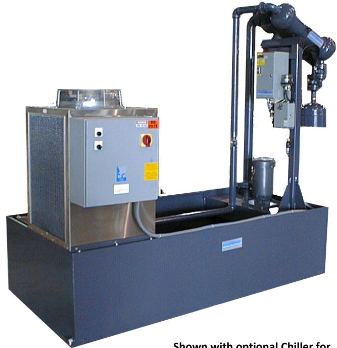
Shown with optional Chiller for Temperature Control

Sludgemaster's Unique Approach To Coolant Management Will Extend Coolant Life By Preventing Contaminants From Accumulating Anywhere In The System. Sludgemasters Combines The Process Of Circulation, Filtration And Evacuation In A Continuous Coolant Management System That Has Few Moving Parts, No Media Replacement And Is Virtually Maintenance-Free. By Using The Unique Centrifugal-Action Of Lakos Separators, Solids Are Transferred Automatically Into A 55-Gallon Drum Or Hopper For Easy Disposal Or Resale As Scrap. All Of These Points Will Lead To Increased Production, Decreased Cost, And A Cleaner Working Environment.