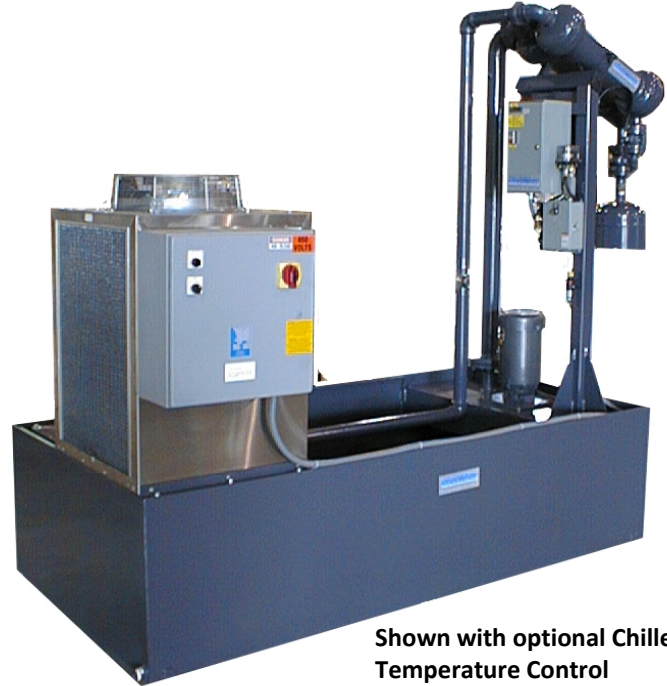
Shown with optional Chiller for Temperature Control

Sludgemaster's Unique Approach To Coolant Management Will Extend Coolant Life By Preventing Contaminants From Accumulating Anywhere In The System. Sludgemasters Combines The Process Of Circulation, Filtration And Evacuation In A Continuous Coolant Management System That Has Few Moving Parts, No Media Replacement And Is Virtually Maintenance-Free. By Using The Unique Centrifugal-Action Of Lakos Separators, Solids Are Transferred Automatically Into A 55-Gallon Drum Or Hopper For Easy Disposal Or Resale As Scrap. All Of These Points Will Lead To Increased Production, Decreased Cost, And A Cleaner Working Environment.