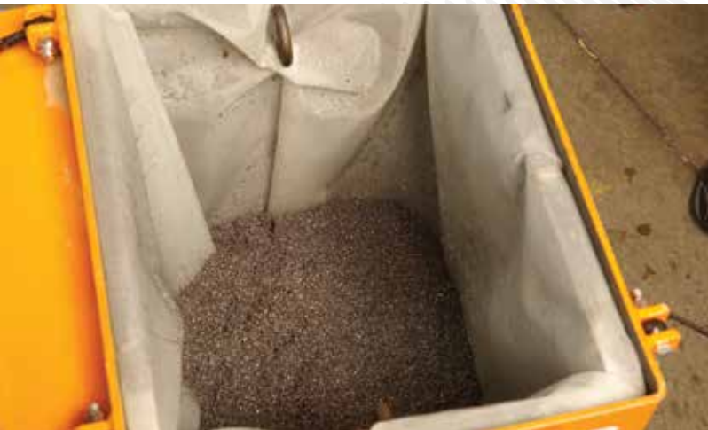
The reusable polypropylene filter sleeve is inserted into the chip basket to filter coolant to 50 microns. Finer filtration of 20 microns nominal can be achieved with a single use paper filter sleeve.

Clean filtered coolant is immediately pumped back into the sump