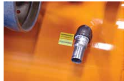
Easy access to the discharge hose connection.