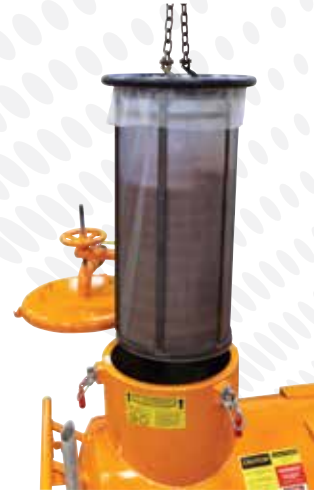
Chip basket captures chips and sludge from dirty coolant during cleaning.