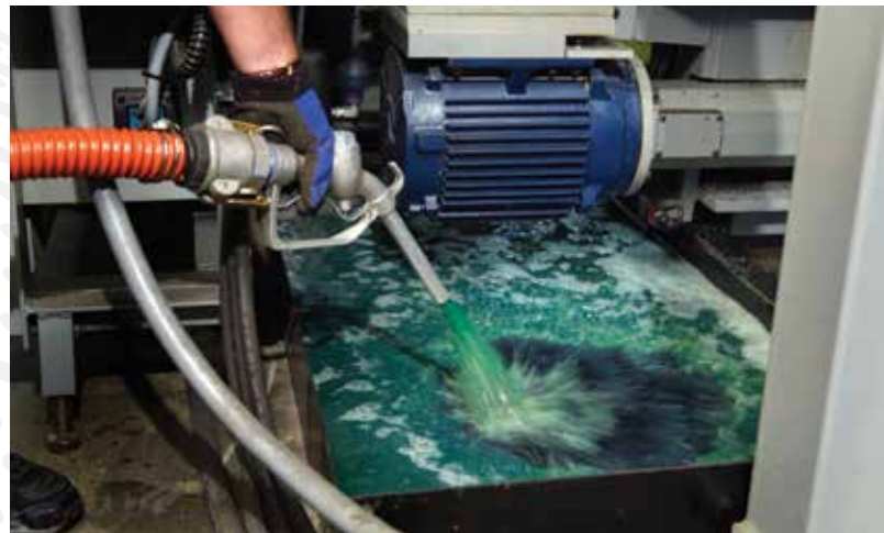
Once filtered, coolant is returned to the sump at a rate of 20 to 40 GPM.