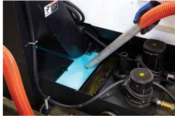
Machine tool coolant, chips and sludge are easily vacuumed out of the sump.