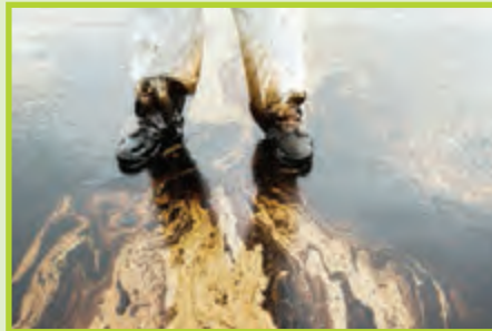
OIL SPILL DISBURSEMENTS