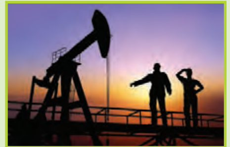
INCREASED OIL PRODUCTION