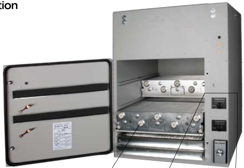
DuroClean™ (Long Life) Electronic Cell

Specifications subject to change without notice.