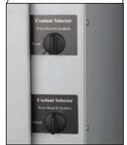
Patented coolant selector