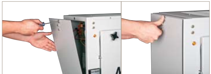
Quarter-turn quick-release fastener