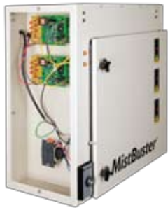
Electrical components isolated from air stream

Specifications subject to change without notice.