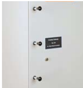
Patented coolant selectors