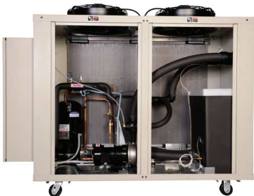
Typical air-cooled unit with tools-free removable doors for easy access to interior components.