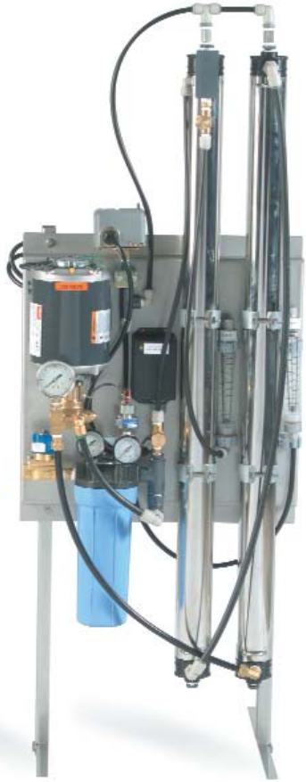
R12-1200-2 system with optional legs