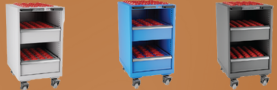
CNC Tool Carts