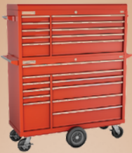
FM Pro Series