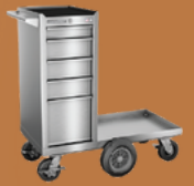
FM Pro & Plus Stainless Series