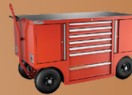
FM Pro Extreme