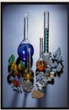
Media & Compounds