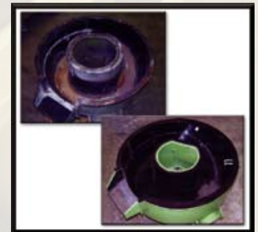
Relines / Repairs