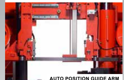
AUTO POSITION GUIDE ARM