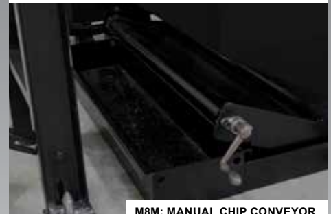
M8M: MANUAL CHIP CONVEYOR