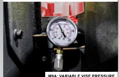
M9A: VARIABLE VISE PRESSURE