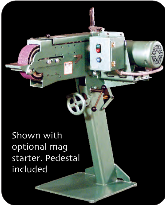
Shown with optional mag starter. Pedestal included

This aggressive belt grinder features a 3 x 79 inch belt track with heavy steel construction to deliver material finishing with the quiet, smoothness that customers expect from a quality grinding machine year after year.