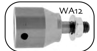
For wheels with 1/2" bore