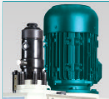
RPF Automatic pitch controlled tapping with single speed brake-motor. (for Series P models)