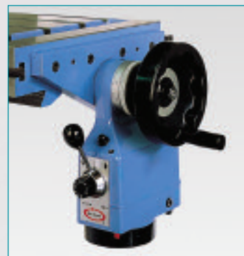
SERVO X SERVO Y Electronic "SERVO" feed unit for X/Y axes. Feed range: .79 to 39.37 in/min Rapid feed: 39.37 in/min Available for MH-4 cross table