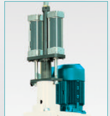
RPF-ANR Automatic pitch controlled tapping with pneumatic rapid approach. (for Series P models)