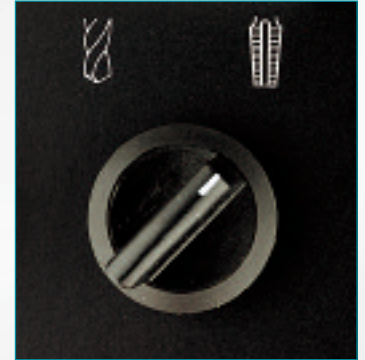
RS Automatic feed reversing system for tapping (standard on Series F/P -RS models)