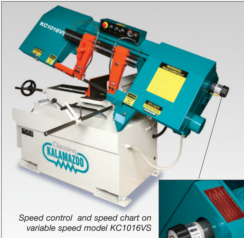
Speed control and speed chart on variable speed model KC1016VS