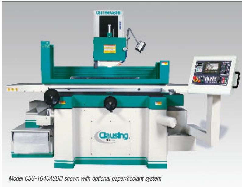
Model CSG-1640ASDIII shown with optional paper/coolant system

Frequency Inverter (Optional) 7.2" Touch Color Screen Chuck Control (Optional)