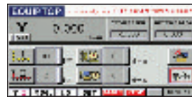
Grinder Condition Input