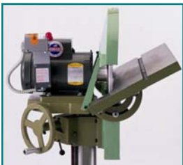
35° Up Tilt