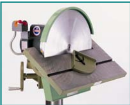
45° Down Tilt