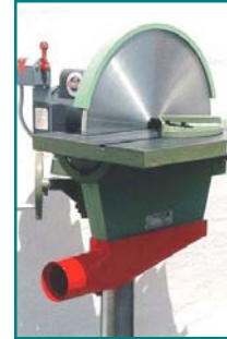
Shown with Optional Dust Shroud