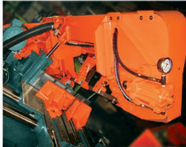
A sturdily built saw bow