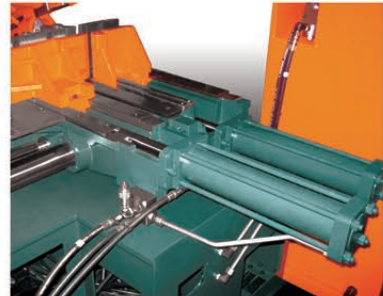
Full stroke hydraulic cylinder