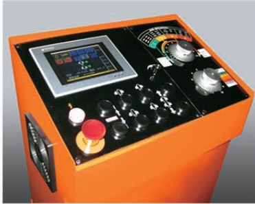
Ergonomic control console & 5.7" touch panel

C-260NC is a high-standard bandsaw machine designed specifically for mass production. Featuring ductile cast iron vises, chrome plated feeding shaft, precision-ground heat-treated worm shafts, rub-free hardened wear plates, shaftless hydraulic motor driven chip auger, 5.7" touch panel, SNC-100 program control, and last but not least, precision feed pressure and feed rate dual valve system, C-260NC is an extremely powerful high performance bandsaw for your mass production needs.