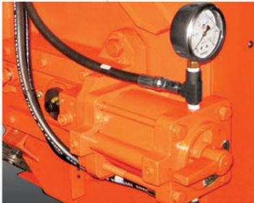
Hydraulic tension cylinder with built-in on/off valve