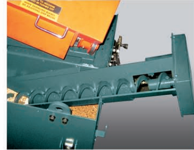
Variable speed hydraulic chip auger