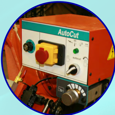
Control Panel with AutoCut Feature and Variable Blade Speed