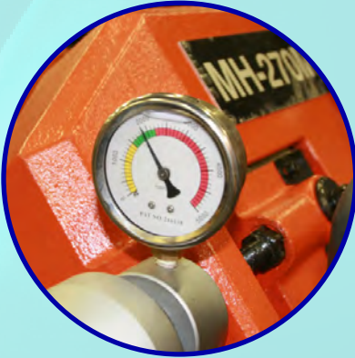
Blade Tension Gauge