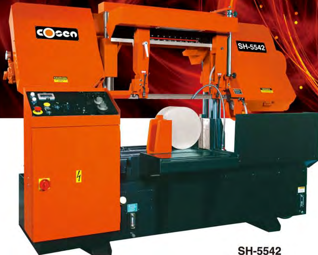
SH-5542 ● 420 mm ■ 420 x 550 mm

Hydraulic lifting take-in roller The take-in roller is actuated in hydraulic force to lift up the stock for easy adjustment of the stock position. The hydraulic lifting roller and a fine feed hand wheel making loading and positioning of material simple. (optional for SH-4030)