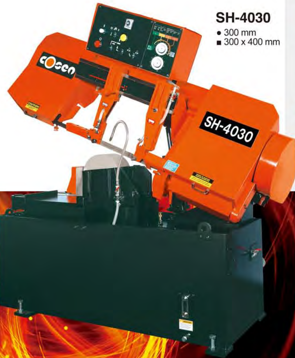
SH-4030 ● 300 mm ■ 300 x 400 mm

COSEN supplies a full range of semi-automatic band saws that exceed the requirements of all bandsawing applications. With its rigid construction and superior features, COSEN's line of semi-automatic heavyduty bandsaws offers precision at the cutting edge, efficiency in operation and low cost per cut, and durability in a demanding production environment.