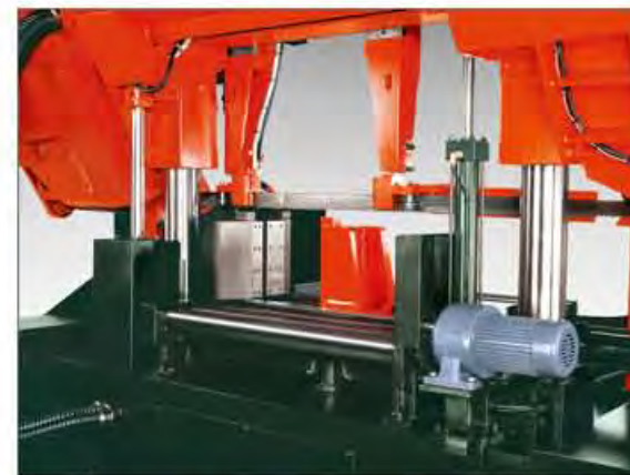
Hydraulic lifting take-in roller with power feeding table (optional)