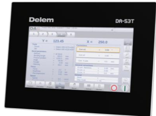
Panel type housing DA-53T-P