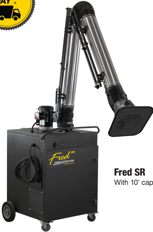
Fred SR With 10' capture arm