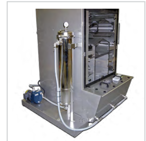
Bag strainer system to remove dust and sludge

*Custom configurations available on request.