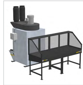
Ducted downdraft table in four standard sizes