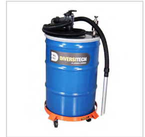
WV-55 Sludge-Vac Removal Vacuum