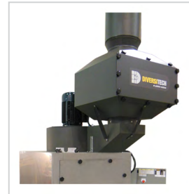
High-efficiency Hepa Afterfilter kit (MERV 17)