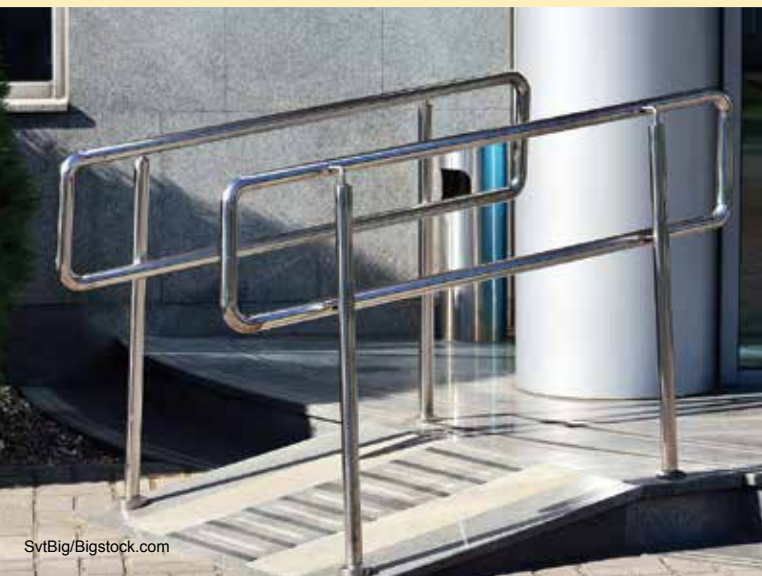
◀ Ercolina Bending Application