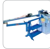
Two Axis Positioner