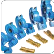
Tube & Pipe Tooling Kits