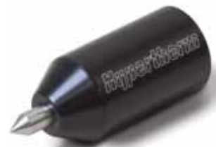
Teach tool kit