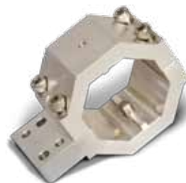
Clamp assembly kit

Data shown are the product of controlled testing in Hypertherm laboratories. Contact Hypertherm for a complete written description of test procedures.