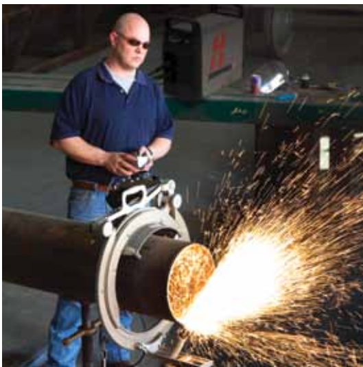
Pipe and bevel cutting

For increased control of the power supply through a CNC, the Powermax65, Powermax85, and Powermax105 are available with an optional RS-485 serial interface port (ModBus ASCII protocol).