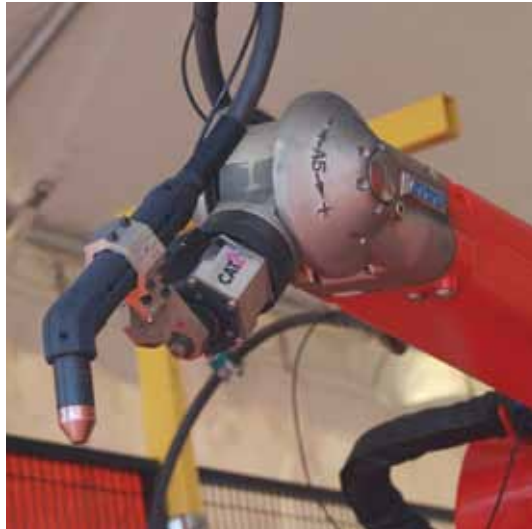
Robotic 3-dimensional cutting