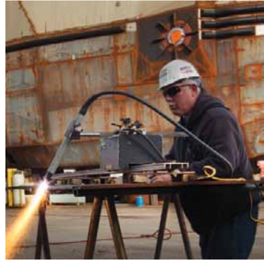
Track cutting and gouging