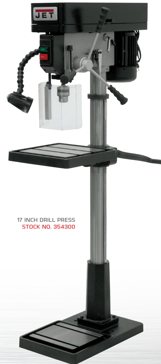
17 INCH DRILL PRESS STOCK NO. 354300