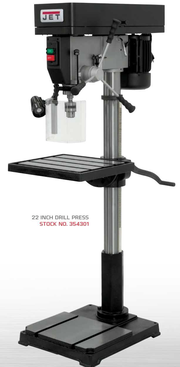
22 INCH DRILL PRESS STOCK NO. 354301