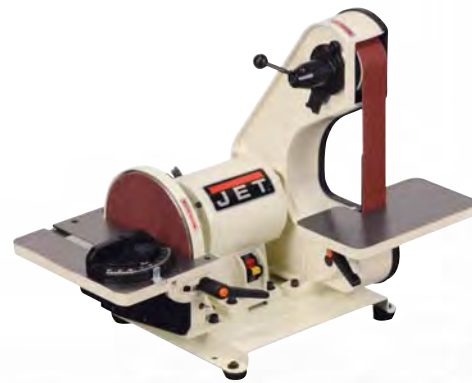
BELT AND DISC