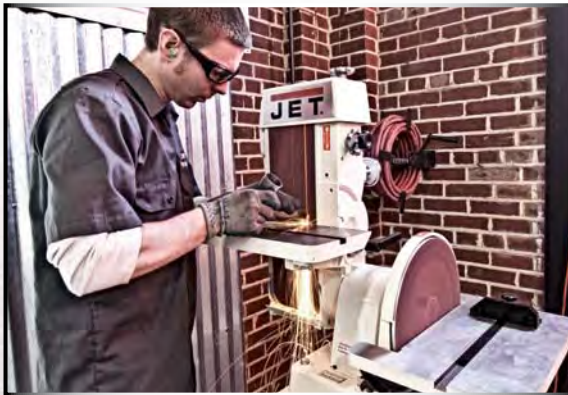
Contour Finishing, Mitering, Flat Finishing, Beveling and Precision Finishing