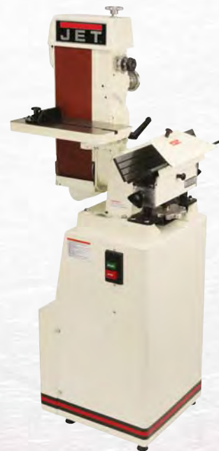
BELT AND CHAMFERING