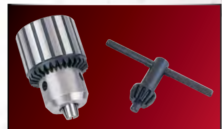
Drill Chuck and Key