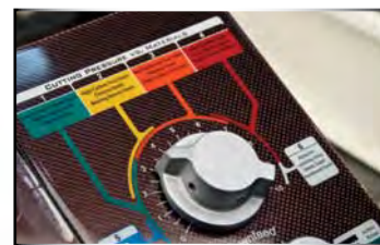
Easy To Use Selection Chart and Dial for Speeds/Materials