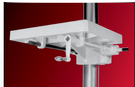
Table Rotates 360 Degrees Around the Column