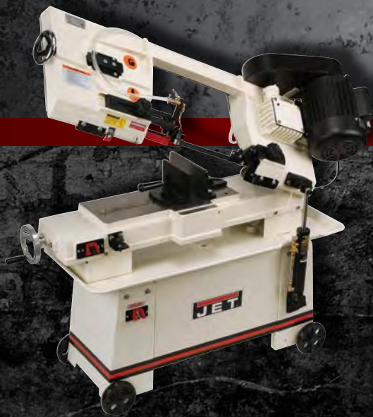
BANDSAWS Pages: 004-013

JET has always been the name shop owners trusted for high-quality machines with superior results. We are pleased to offer an expanded selection of machines in our sawing, drilling and finishing categories. This expansion will offer you more options and meet even the most stringent demands. With our new machines you can build a complete JET shop, ensuring consistency and quality across the entire range of any job or project.