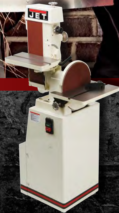
FINISHING Pages: 031-039