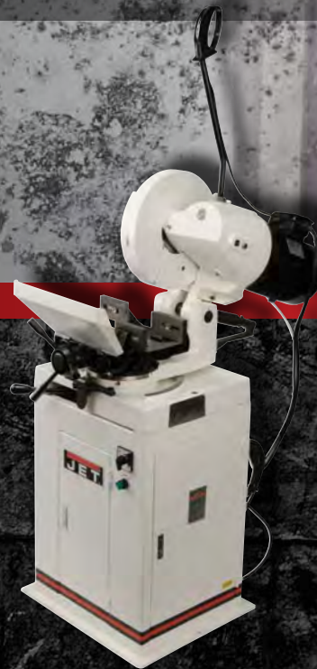
COLDSAWS Pages: 014-016