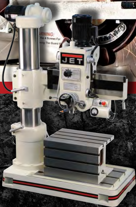
DRILLING Pages: 017-030