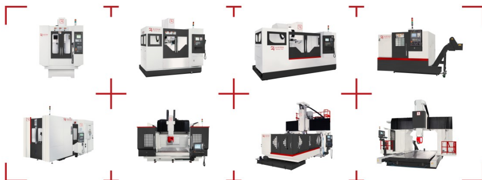
Jupiter's Expansive Line of World-class CNC Machine Tools

Maximize the productivity and efficiency of your existing operations through first-class engineering and service.