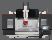
5-Axis Gantry VMC