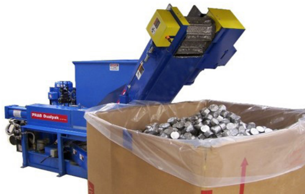
Dualpak Briquetters help keep the shop clean