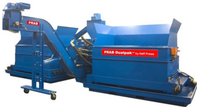
Systems with dual feed hoppers are available