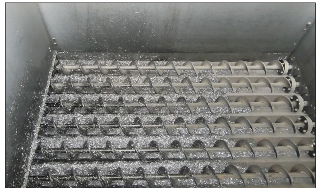
Live bottom hopper includes multiple 6" augers