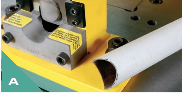
A PIPE/TUBE NOTCHING ATTACHMENT