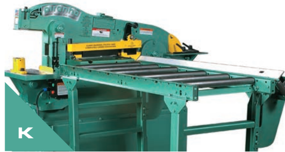
K ROLLER FEED TABLES