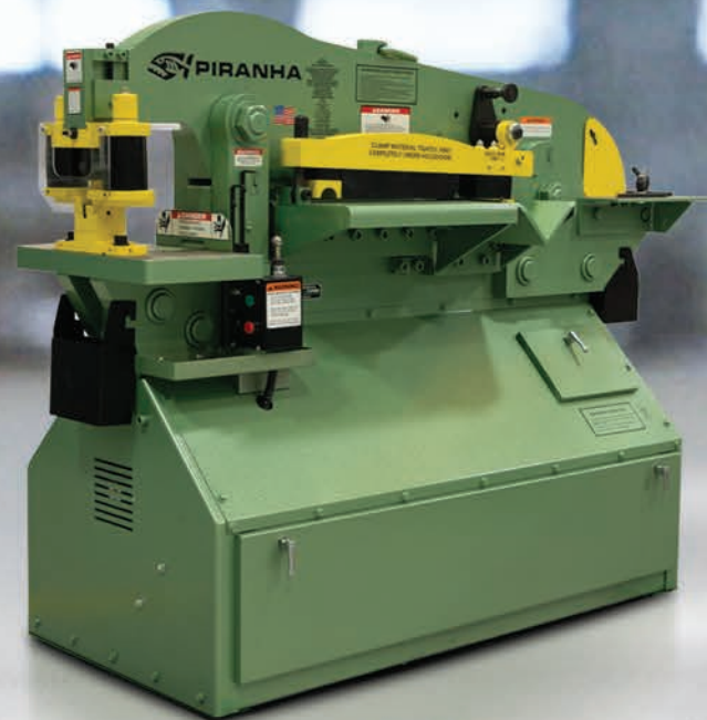
P-90 P-110 P-140