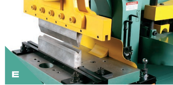
E PRESS BRAKE TOOLING HOLDERS