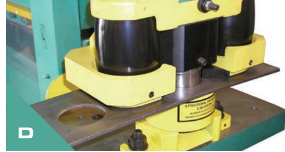
D 28XX PUNCH ATTACHMENT