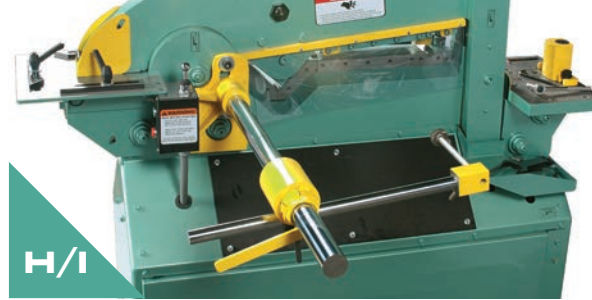
H/I MECHANICAL/ELECTRICAL BACK GAUGES