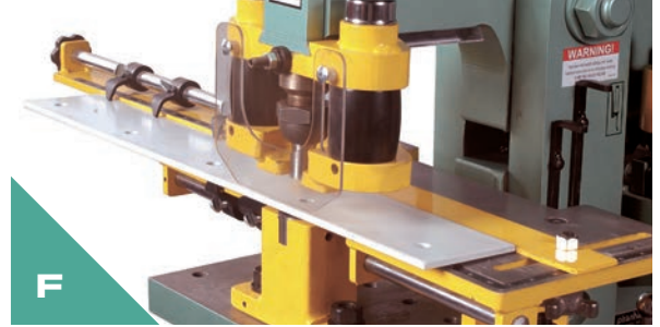
F QUICKSET GAUGING TABLES