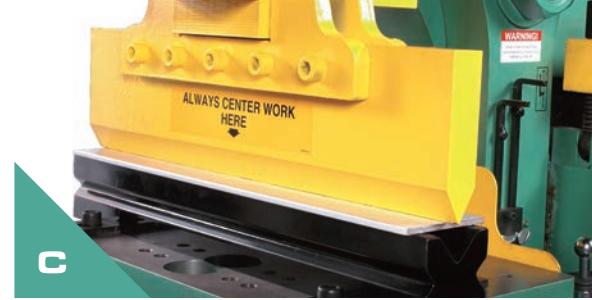
C BENDING ATTACHMENT