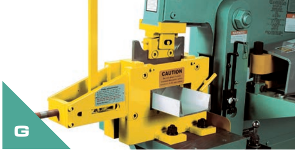
G CHANNEL SHEAR