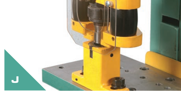
J 1-1/2" OVERSIZE PUNCH ATTACHMENT