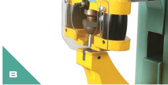
B CHANNEL DIE BLOCK