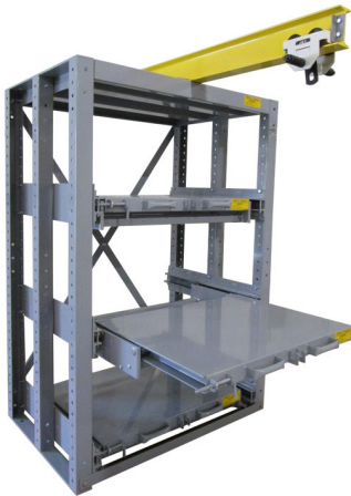
Glide-Out with Monorail Crane

Custom powder colors Enclosed sides, back, & doors Rear load shelves Safety Interlock system