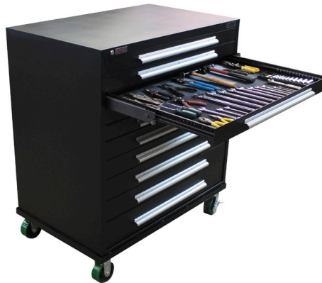
Custom Tool Cabinet