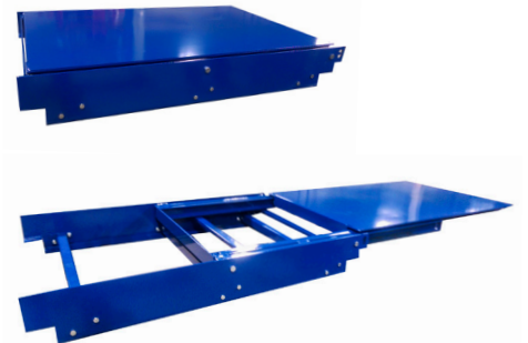
Shelf Mounted Glide-Out Shelving