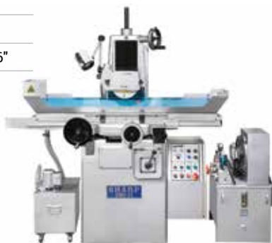
Table 6" x 18"