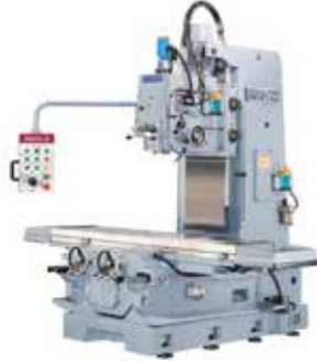
Table 20" x 87"