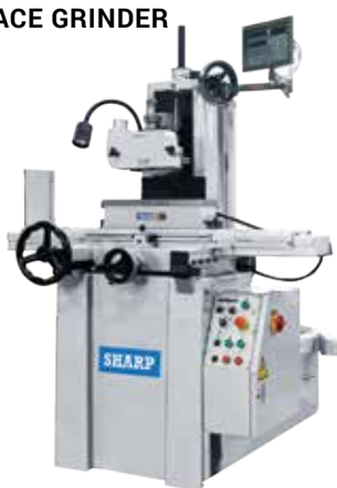
Table 6" x 18"