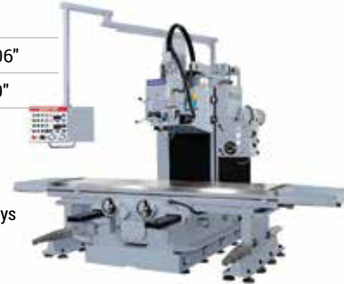
Table 30" x 106"