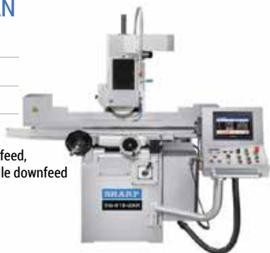
Table 6" x 18"