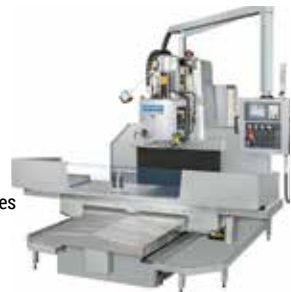
Table 23.6" x 86.6"