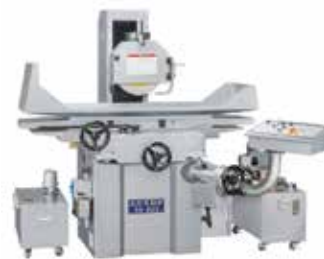
Table 9" x 20"