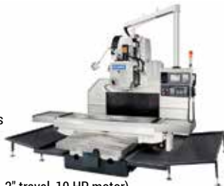
Table 23.6" x 86.6"