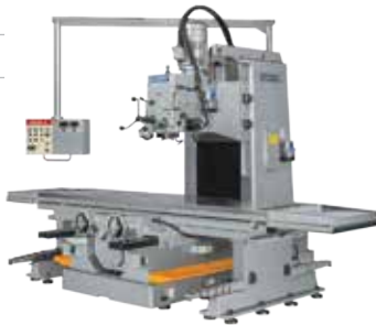
Table 30" x 106"