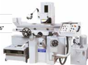
Table 8" x 20"