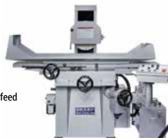
Table 12" x 24"