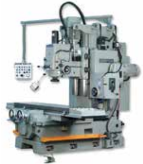
Table 20" x 87"