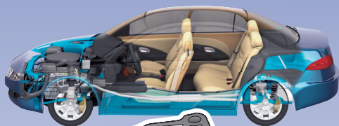
Automotive Valve Body