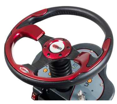
Intuitive dashboard, one touch button and user friendly menu for operation settings