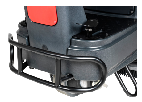
Front bumper protects the machine