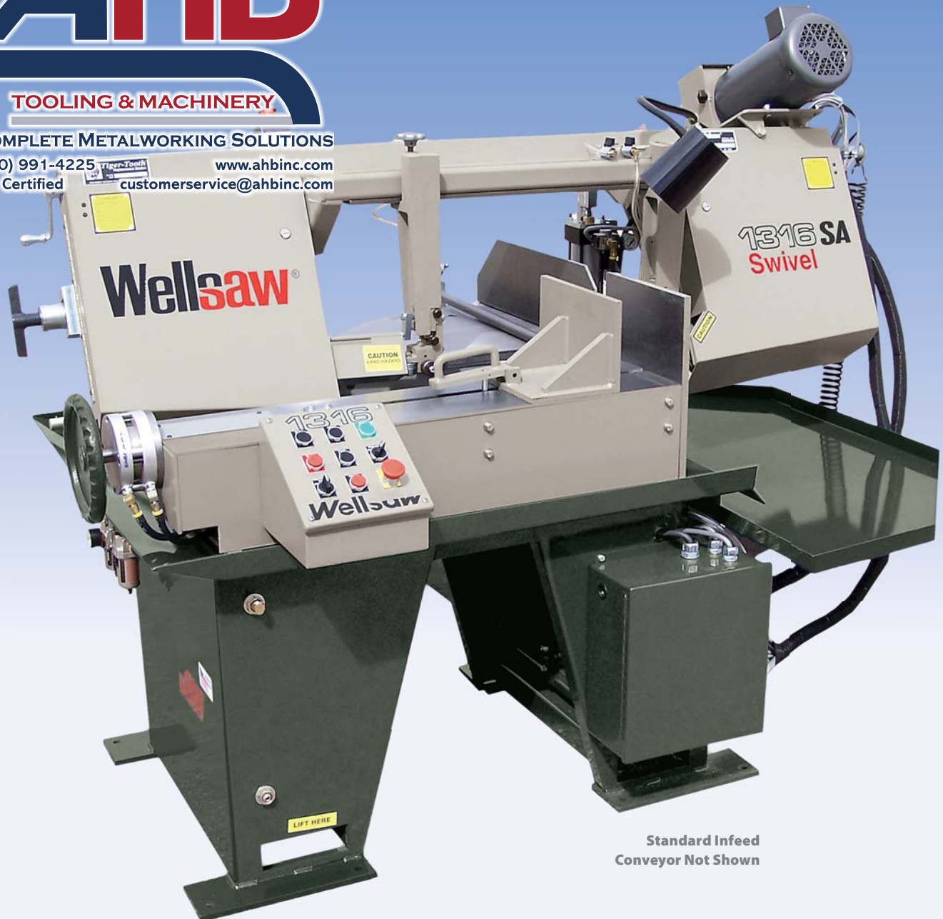
Standard Infeed Conveyor Not Shown

(800) 991-4225 www.ahbinc.com ISO Certified customerservice@ahbinc.com